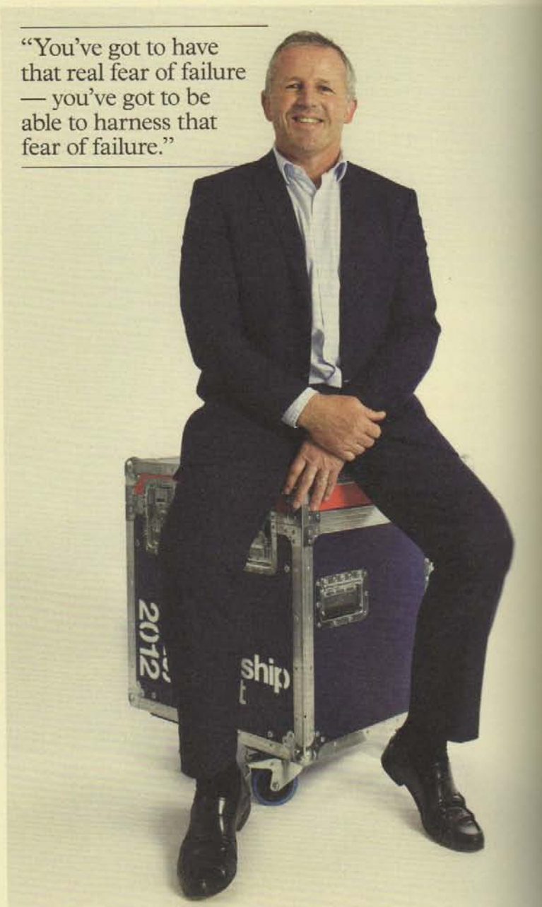
SEAN FITZPATRICK: OUT OF THE BOX LEADERSHIP

“You’ve got to have that real fear of failure — you’ve got to be able to harness that fear of failure.”